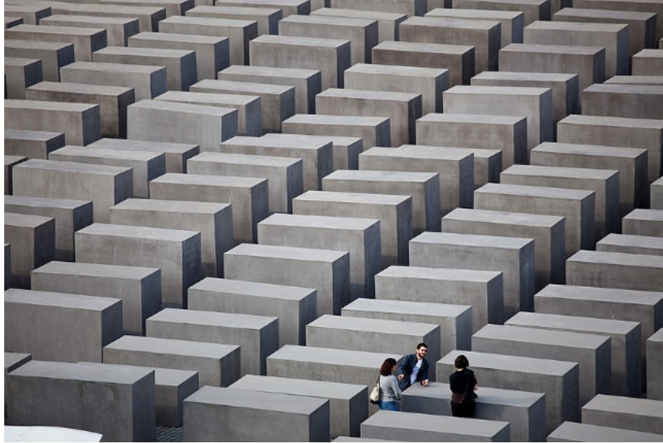
Holocaust Memorial in Berlin, Germany